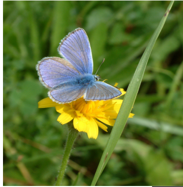
The Wildlife Trust BCNP

Brimstone butterflies are known as Gonepteryx, part of the Pieridae family. They live in Europe, as well as Asia and Northern Africa and are known for the bright yellow colour of their wings..