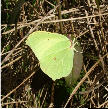
The Wildlife Trust BCNP