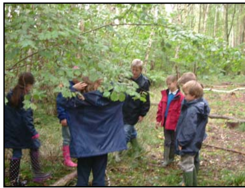
Tree shaking to find minibeasts

... create a new woodland area by planting the seeds they found