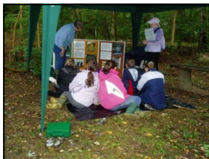
Learning about famous artists