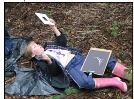
Looking at branch designs

... 'Branches & Leaves' Create woodland skiescapes with paint and natural materials to include in a collage of the class' 'Woodland Thoughts'.