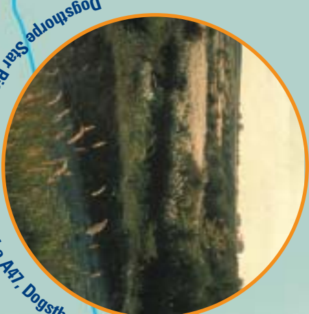
Dogsthorpe Star Pit, Whitepost Road, off the A47, Dogsthorpe