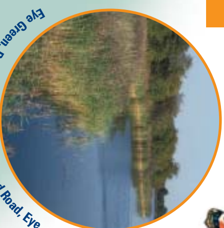
Eye Green, Pershore Way, off Crowland Road, Eye