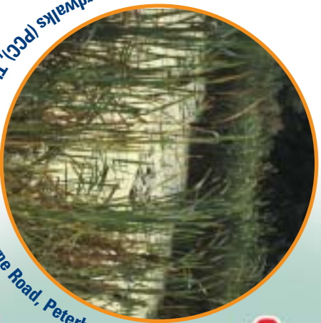
The Boardwalks (PCC), Thorpe Meadows, off Thorpe Road, Peterborough